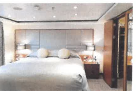
SEVEN SEAS SUITE

SS - SEVEN SEAS SUITE $19,149 per person* 545 SQ. FT. INCL. BALCONY Decks 7, 8, 9, 10 (waitlist)