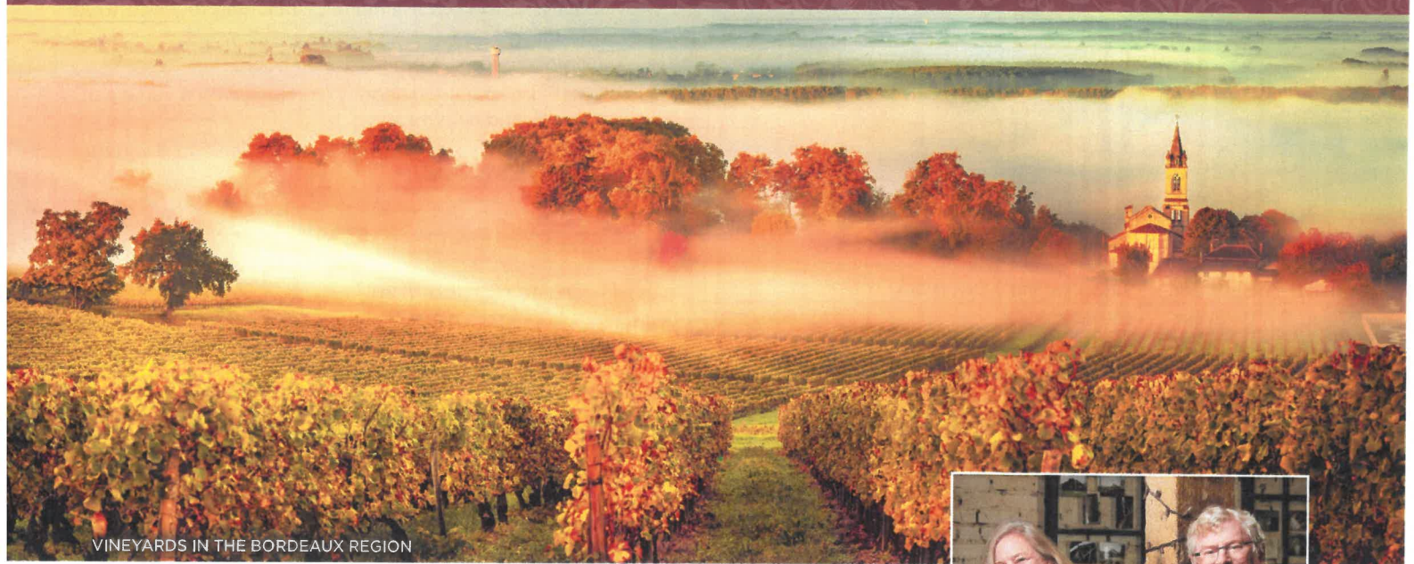
VINEYARDS IN THE BORDEAUX REGION

Uncork local traditions, savor intense flavors and enjoy palate-pleasing adventures during an AmaWaterways Wine Cruise